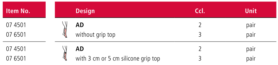
Table of sizes